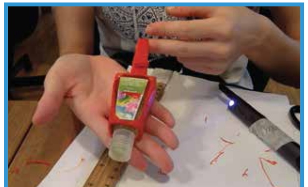
Step 6: Peel your doodle off from the masking tape and peel off the masking tape. Now you have your own hand sanitizer holder.