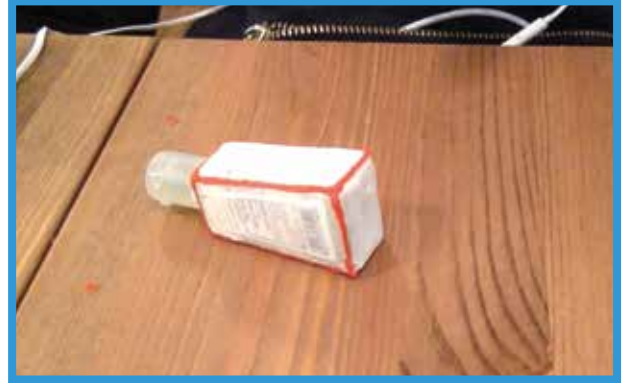
Step 2: Doodle the edges of the hand sanitizer.