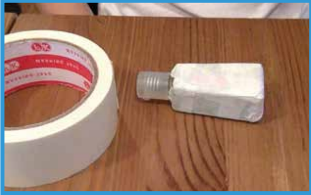
Step 1: Get a hand sanitizer and cover it up with masking tape.