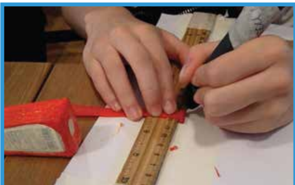
Step 5: Make the button of the holder about 0.5cm thick. After you're done, make sure the holder works. Connect the bottom of the holder to the top of the hand sanitizer.