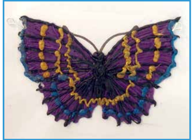
4: third layer: metallic details