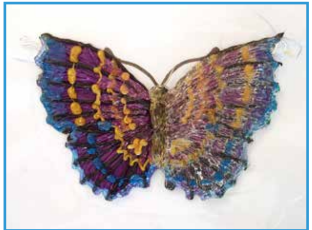
6: fifth and last layer: clearly clear on top of everything